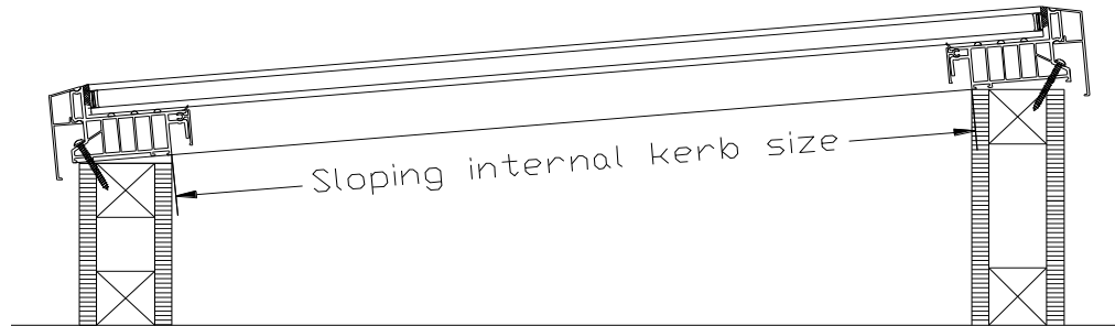
SIDE ELEVATION (WIDTH)