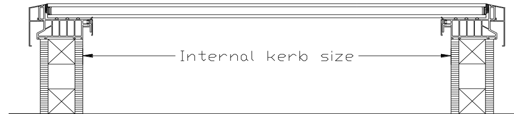
FRONT ELEVATION (DEPTH)

If you wish to place an order please sign and email/fax back.